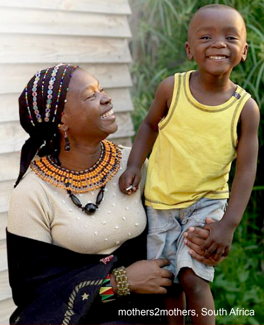
mothers2mothers, South Africa