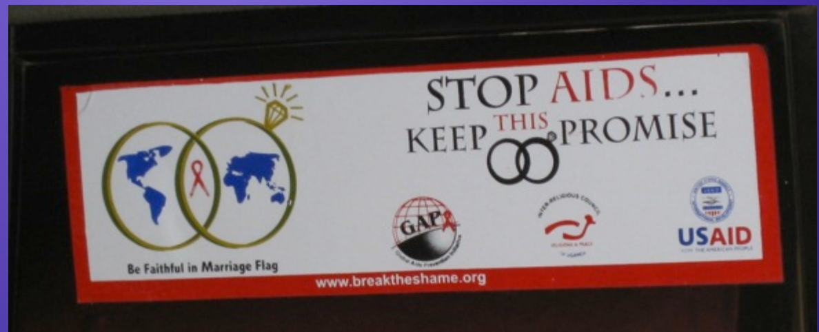
USAID “Be faithful in marriage” bumper sticker on bus (Uganda)