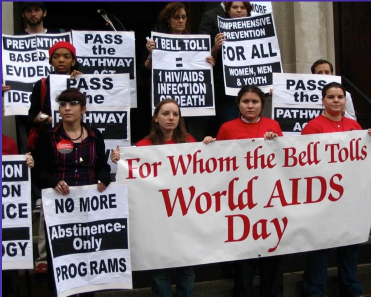
World AIDS Day 2006 demonstration outside church (Washington, D.C.)